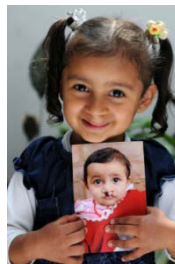
Gift of a Smile $240