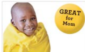
Warm Blankets for 6 kids $60