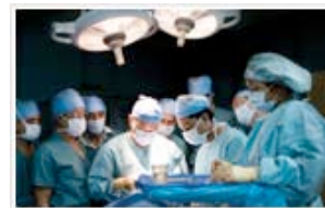
Stock an Operating Room $500