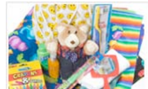
Smile Bags for 150 kids $100