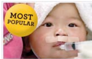
Antibiotics for 10 kids $30