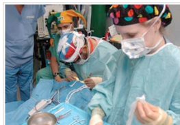
Supplies for 1 surgery $75

If you would like to give children other ways to smile visit http://www.operationssmile.org/gift-catalog/home.html